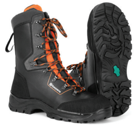
PROTECTIVE BOOTS - (LEATHER) WITH SAW PROTECTION C20 SIZE - EU 42, AU/NZ 8 597 65 94-42