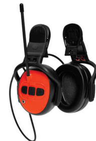
FM RADIO EARMUFF 578 27 49-04