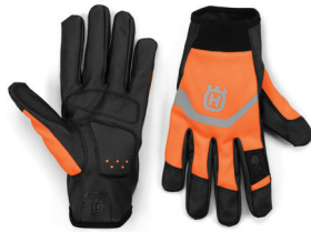
GLOVES, FUNCTIONAL LIGHT NON-SLIP 529 88 02-07