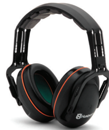
PREMIUM EARMUFFS WITH HEADBAND 505 66 53-04