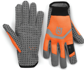
GLOVES, FUNCTIONAL LIGHT VENT 529 88 01-07