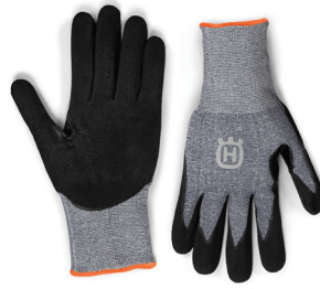
GLOVES, TECHNICAL GRIP 529 88 03-07