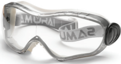
PRO SAFETY GOGGLES WITH ANTI-FOG LENS 544 96 39-01