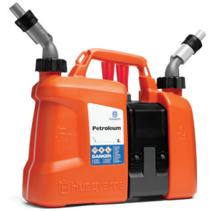
COMBI CAN 5 + 2.5L 580 75 42-01