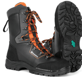
PROTECTIVE BOOTS - (LEATHER) WITH SAW PROTECTION C20 SIZE - EU 45, AU/NZ 10.5 597 65 94-45