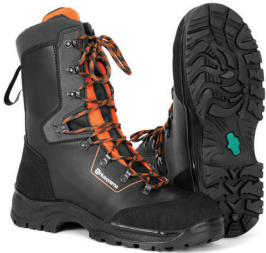
PROTECTIVE BOOTS - (LEATHER) WITH SAW PROTECTION C20 SIZE - EU 43, AU/NZ 9 597 65 94-43