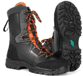
PROTECTIVE BOOTS - (LEATHER) WITH SAW PROTECTION C20 SIZE - EU 46, AU/NZ 11 597 65 94-46