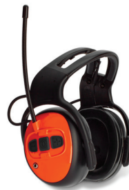
FM RADIO EARMUFFS 578 27 49-03