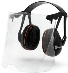
GARDEN EARMUFFS WITH PERSPEX VISOR 505 66 53-60