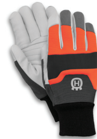
GLOVES WITH SAW PROTECTION, FUNCTIONAL SIZE - 10 595 00 39-10