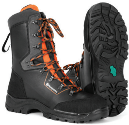
PROTECTIVE BOOTS - (LEATHER) WITH SAW PROTECTION C20 SIZE - EU 39, AU/NZ 5.5 597 65 94-39