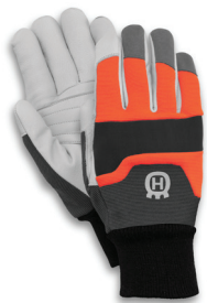
GLOVES WITH SAW PROTECTION, FUNCTIONAL SIZE - 12 595 00 39-12