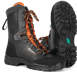
PROTECTIVE BOOTS - (LEATHER) WITH SAW PROTECTION C20 SIZE - EU 44, AU/NZ 9.5 597 65 94-44