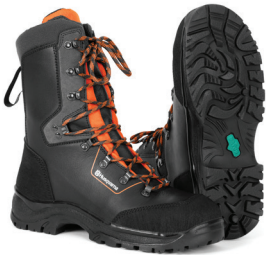
PROTECTIVE BOOTS - (LEATHER) WITH SAW PROTECTION C20 SIZE - EU 47, AU/NZ 12 597 65 94-47