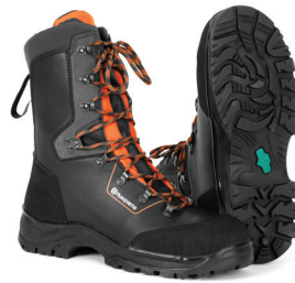
PROTECTIVE BOOTS - (LEATHER) WITH SAW PROTECTION C20 SIZE - EU 41, AU/NZ 7.5 597 65 94-41