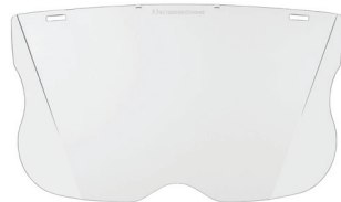
VISOR - PLEXI 505 66 53-43