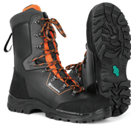
PROTECTIVE BOOTS - (LEATHER) WITH SAW PROTECTION C20 SIZE - EU 40, AU/NZ 6.5 597 65 94-40