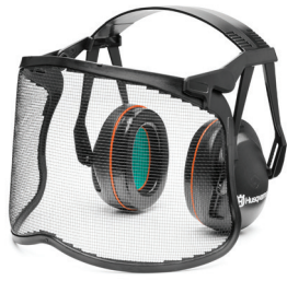
GARDEN EARMUFFS WITH MESH VISOR 505 66 53-61