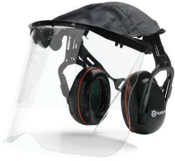
PREMIUM EARMUFFS WITH PLEXI VISOR 505 66 53-48